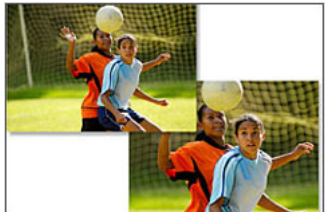
For sports and wildlife shooters the smaller sensor has the effect of making their telephoto lenses and zooms even more powerful.

So which is right for you? Each has its own benefits and each has its limitations, and if you're building a DSLR system from scratch you needn't get too hung up on which is right for you.