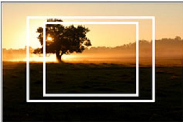
The three most common sensor sizes compared: full frame, APS-C and Four-thirds. Smaller sensors 'crop' the scene and make a lens appear to have a longer focal length.

For telephoto shooters the result is quite a bonus, as all your lenses will effectively get even more powerful. On the other hand the crop factor means your wide-angle lenses will no longer offer anything like a 'wide' field of view. Fortunately there is a wide range of specially designed 'digital only' lenses for smaller sensor DSLRs.